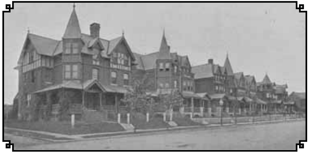
North side of Springfield Avenue, looking east from 49th. Reproduced from The City of Philadelphia: As it Appears in the Year 1894 , George S. Harris & Sons, Philadelphia, PA, 1894

The world-wide prestige of the reign of Queen Victoria (1837-1901) made it convenient for historians in the English-speaking world to refer to a big chunk of the nineteenth century as the Victorian period. But there was a confusion when it came to sorting out the facts, especially when it came to the issue of style . To be clear, there is no such thing as a Victorian style . When the preponderance of houses were built in University City, from 1890 to 1910, the style of choice was the Queen Anne style. Chronologically, the Queen Anne style spans the last third of the reign of Queen Victoria. Today in popular usage, a house described as “Victorian” might well be Queen Anne, where all the decorative and technological impulses of the period came together with a broad inclusiveness of the world’s architectural forms.