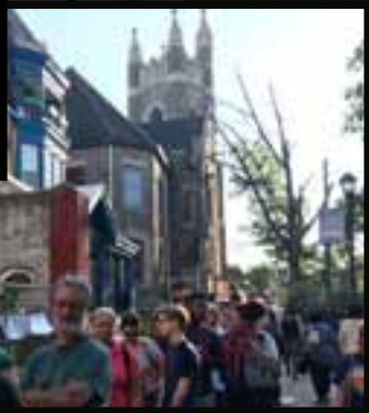
Highlights of the Baltimore Avenue Dollar Stroll.