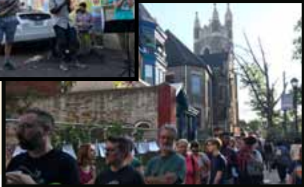
Highlights of the Baltimore Avenue Dollar Stroll.