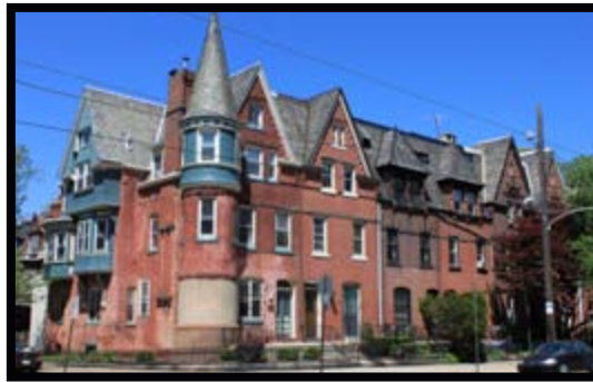
42nd Street, north of Pine Street in Spruce Hill.

Alas, even with the promise of more personnel at the PHC, the same old issues continue to plague the process. The December meeting of the PHC lasted for over four hours, with most of the time taken up by the consideration of alterations to already protected buildings and a lengthy presentation about the technicalities of adapting historic buildings for energy efficiency. In all that time, only a single building was given protection from demolition.