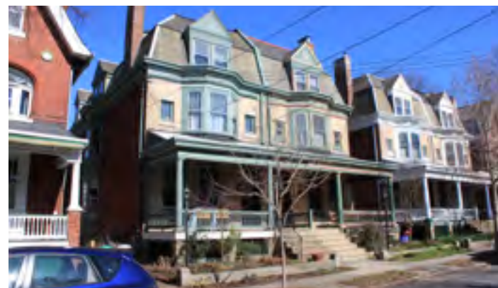
Twin houses on the 4800 block of Windsor Avenue.

Trumbauer began his career by working for the Hewitt Bros. before opening his own office in 1890. He would draw from a wide range of styles, from French to Georgian Revival, for his projects. Trumbauer is also notable for hiring Julian Francis Abele, the first African-American graduate from the Penn's School of Architecture. Trumbauer's more recognizable works are the Philadelphia Museum of Art, the Free Library on Logan Square, and the Irvine Auditorium at Penn.