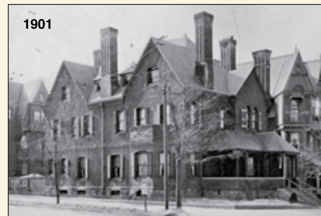
1901 Photo by Moses King.