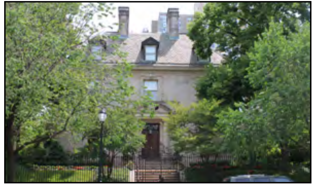
The President's House (Eisenlohr Hall), 3812 Walnut St.

The University of Pennsylvania's President's House (3812 Walnut Street) was originally the house of Otto Eisenlohr, 1910-1911. The house, designed by Horace Trumbauer, was strongly influenced by French Classicism of the seventeenth century. Otto Eisenlohr was a cigar manufacturer.